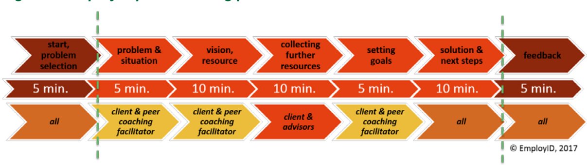
Figure 1: EmployID peer coaching process

Peer coaching in EmployID implies three roles: (i) the "client" who presents a specific work challenge (ii) the "peer coaching facilitator" who moderates the process and asks the client "powerful questions" and (iii) the "advisors" who bring in their experiences and opinions in two steps of the peer coaching process. The three roles help to support the client in finding a solution that fits their individual circumstances. The peer coaching group members are colleagues with a common professional focus and are of equal rank. All members of the group are trained in peer coaching and agree upon a code of ethics and rules that the whole group develops together in advance. Figure 1 sets out the stages of the EmployID peer coaching process and is explained in more detail below.